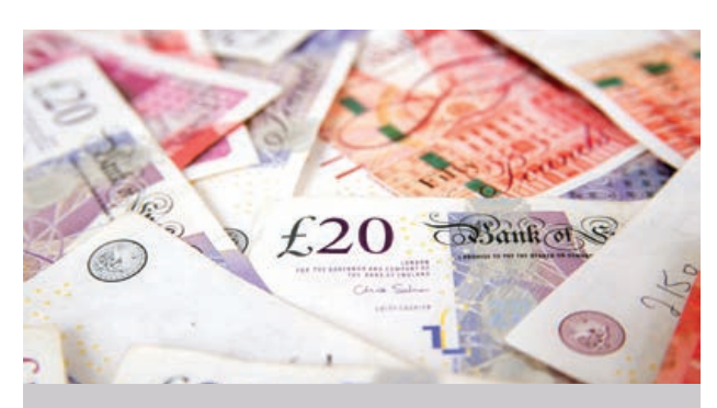
The first £2,000 of dividends are tax-free.